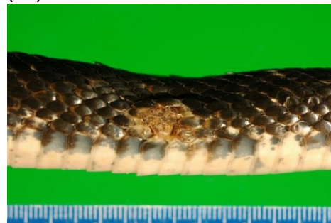
Figure 1A. Eastern rat snake ( Pantherophis alleghaniensis ) from New Jersey, USA, showing signs of snake fungal disease. Obvious external abnormalities are an opaque infected eye (spectacle) and roughened, crusty scales on the snout. Photograph by D.E. Green, USGS National Wildlife Health Center. Figure 1B. Eastern rat snake from New Jersey, USA, showing signs of snake fungal disease with crusting on lateral scales. Photograph by D.E. Green, USGS National Wildlife Health Center.