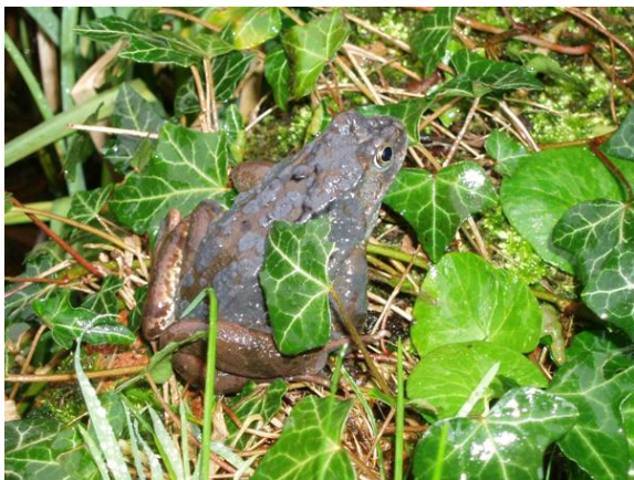
Figure 1. Common frog ( Rana temporaria ) with ranid herpesvirus skin disease

Common toads infected with BfHV1 also tend to develop skin abnormalities during the breeding season, which look like raised black or dark brown patches that can join together to form large lesions. However, unlike ranid herpesvirus skin disease, there is some evidence that common toads with bufonid herpesvirus skin disease may become ill with associated mortality. Further investigation is required to determine the clinical significance of this disease on common toad health.