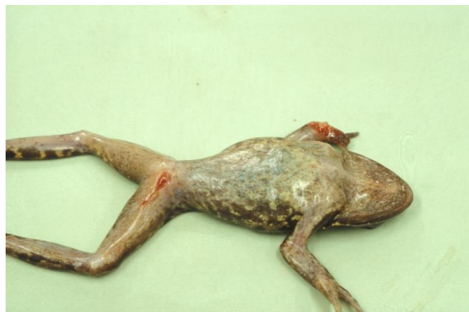
Figure 1. Common frog ( Rana temporaria ) with ranavirus disease showing skin ulceration and loss of digits.

Outbreaks of ranavirosis can vary from the presence of numerous dead and/or sick amphibians (which are often visible in, and surrounding, water bodies), to individual sick animals being seen. Affected adult amphibians may have reddening of the skin, skin ulceration, bloody mucus in the mouth and might pass blood from the rectum; often there is internal bleeding (which is detected on post-mortem examination). Often, large numbers of dead animals are found with no evidence of disease, but these animals invariably have died of internal bleeding. Individual sick animals usually are lethargic and have skin ulceration or loss of digits (fingers and toes), which sometimes progresses to the loss of entire feet (Figure 1).